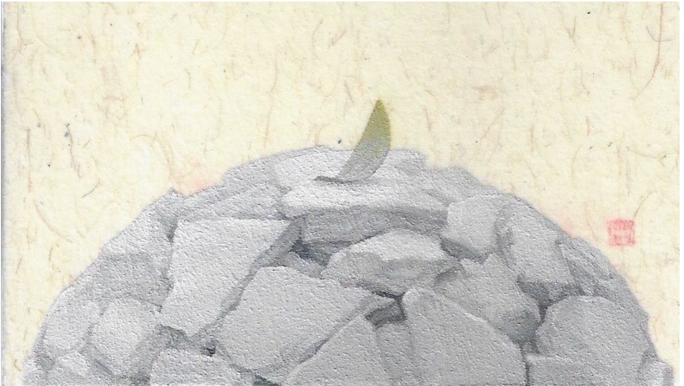
Loi Cai Xiang ( artwork detail) Present Day Advent Artwork